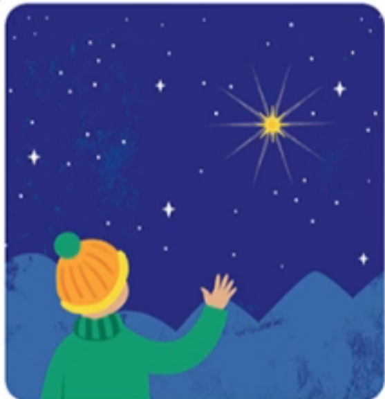
a far star