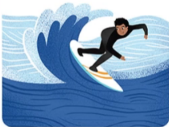
turn in the surf